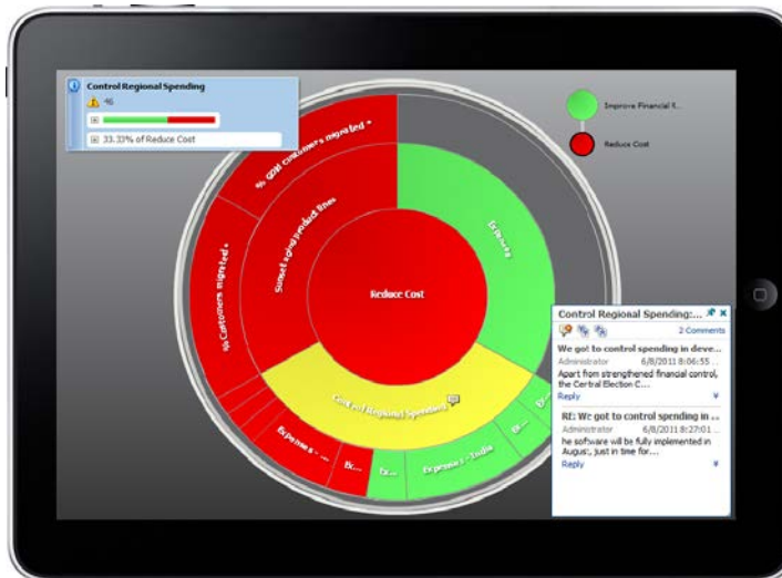
Figure 2: Oracle Scorecard and Strategy Management - Contribution Wheel