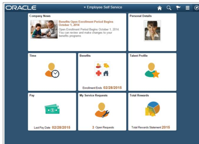
Powerful, smart self-service capabilities