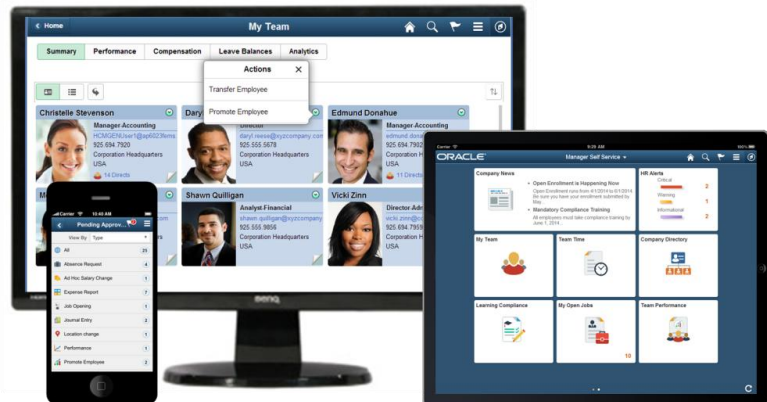
Simple, intuitive user experience on any device